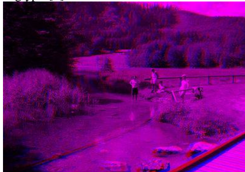
Fig.2 True Anaglyph[3]

Fig.1 shows the example of a true anaglyph.[3]