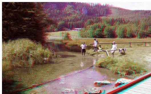
Fig.6 Optimised Anaglyph [3]

Fig.5 shows the optimised anaglyph example [3]