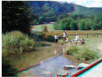
Fig.4 ColorAnaglyph [3]

Fig.3 shows the example of color anaglyph.[3]