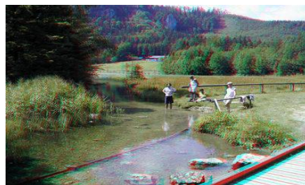
Fig.5 Half Color Anaglyph [3]

Fig.4 shows the example of half color anaglyph.[3]