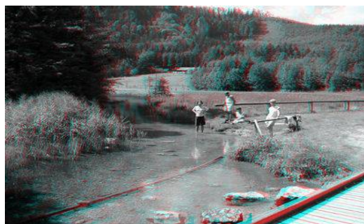
Fig.3 Gray Anaglyph [3]

Fig.2 shows the gray anaglyph example.[3]